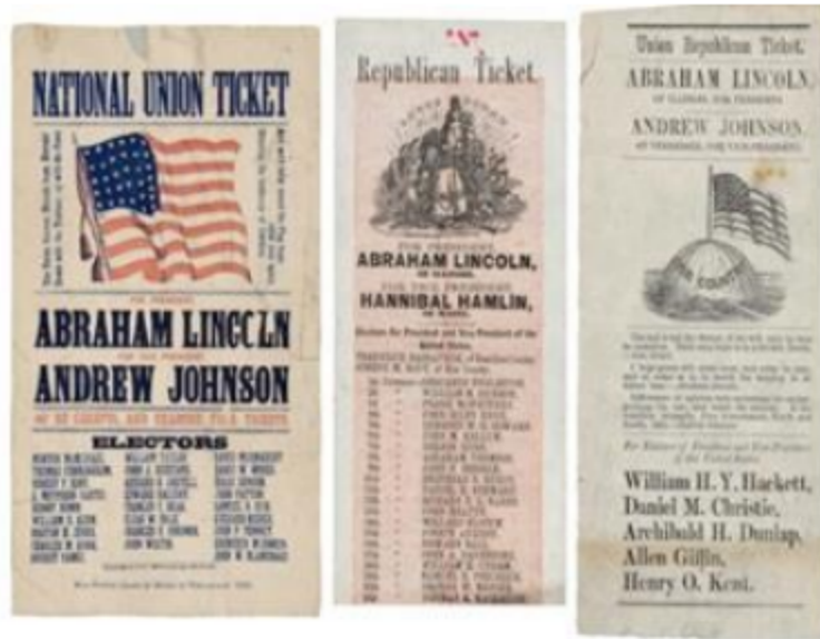
Party tickets for the Republican/National Union party and candidate Abraham Lincoln in the elections of 1860 and 1864.(Library of Congress)

49. Party tickets had the same vulnerabilities as voice voting to rewards and retaliations corrupting the voters' individual, free choices. They were supplied by political parties and had contrasting colors so that it was simply a matter of observation to know which ballot the voter slipped in the box, as shown below in the images from the elections of 1860 and 1864 involving Abraham Lincoln. There was no secrecy and thus ample opportunity for a voter's choices to be influenced by promises of rewards or fears of retaliation for voting deemed "incorrect" by others—employers, guilds, or trade associations.